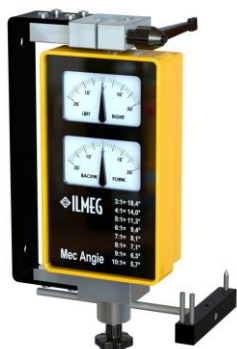
MEC-ANGIE Precision drilling instruments