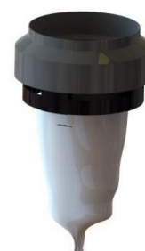
BHS 100 Bag Handling System