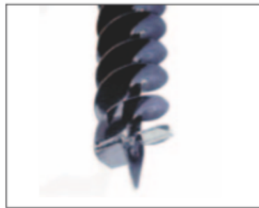
Cutters for alluvial soil