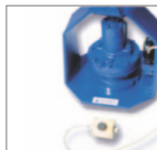
Head with reversal rotation driver