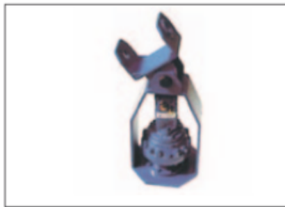
Head T3 with steel frame and double articulation