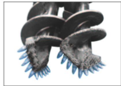
Points for rocky, stony soils for series "Mini"